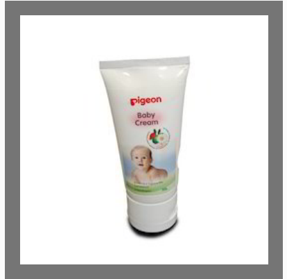
Pigeon Baby Cream