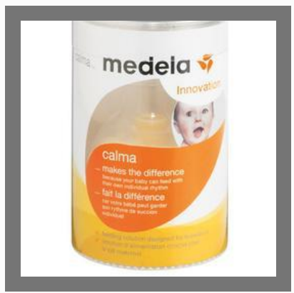
Medela Calma Solitaire