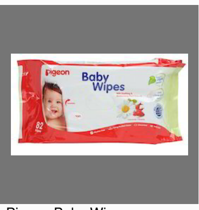
Pigeon Baby Wipes