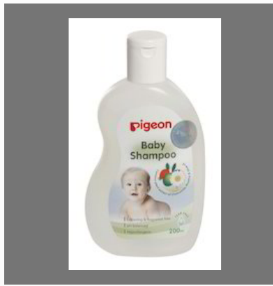
Pigeon Baby Shampoo