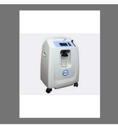
Respircare Oxygen Concentrator - For Rent & Sale