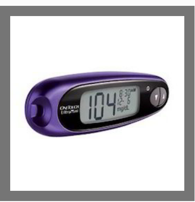
Blood Glucose Meter