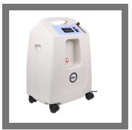
Olex Oxygen Concentrator