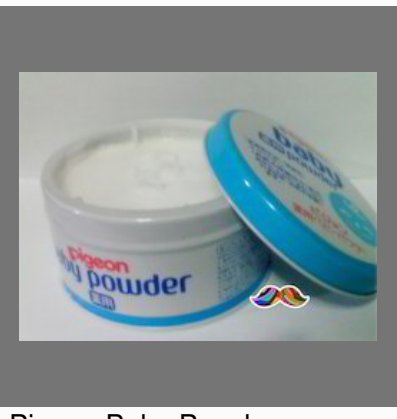
Pigeon Baby Powder