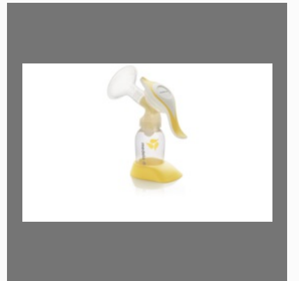
Medella Harmony Manual Breast Pump