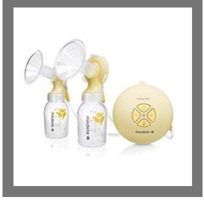
Medela Swing Maxi Double Electric Breast Pump