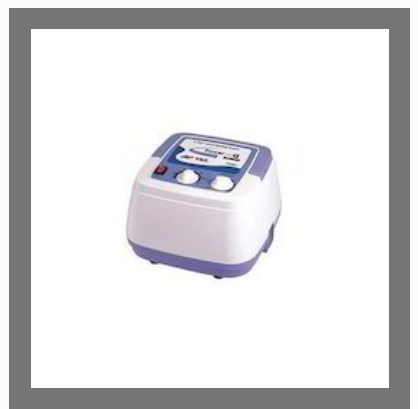
Limb Therapy Machine