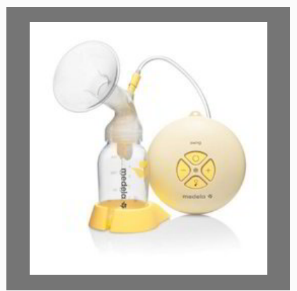
Medela Swing Electric Breast Pump