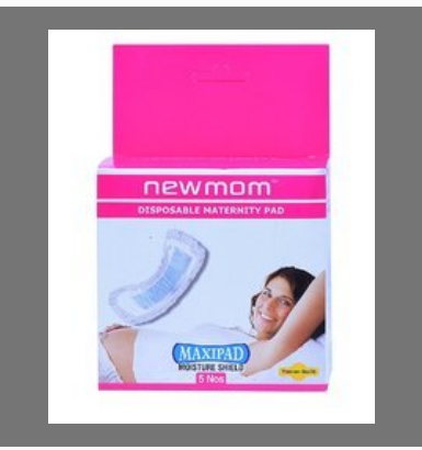
New Mom Disposable Maternity Pads