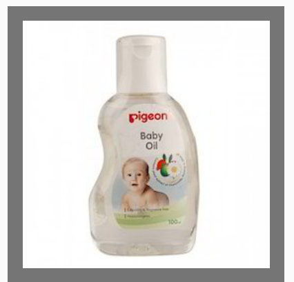
Pigeon Baby Oil